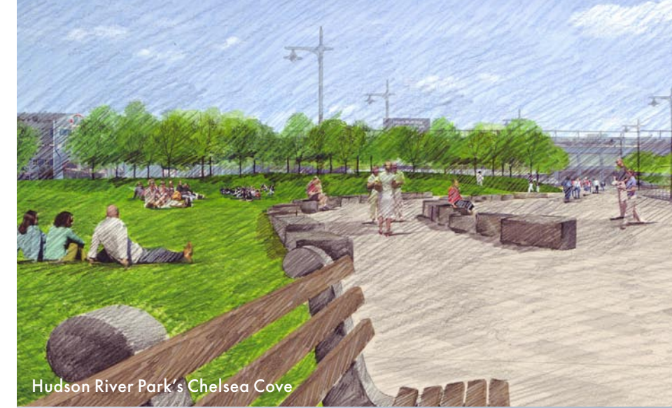
Hudson River Park's Chelsea Cove