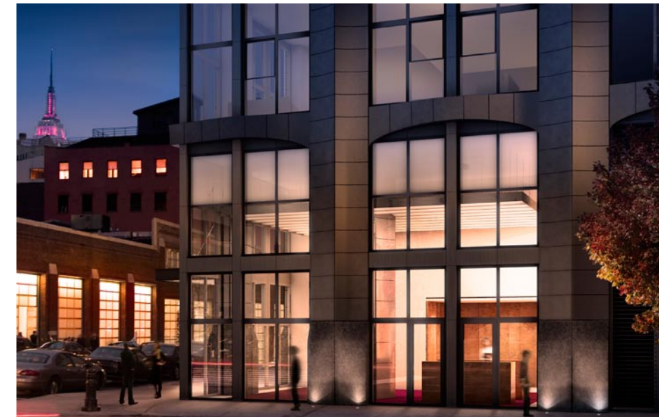
Chelsea Arts District